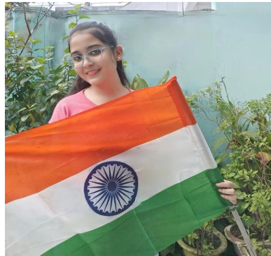
Image 3: "Families and residents across the community waved the Tiranga at their homes, spreading the message of 'Har Ghar Tiranga'."