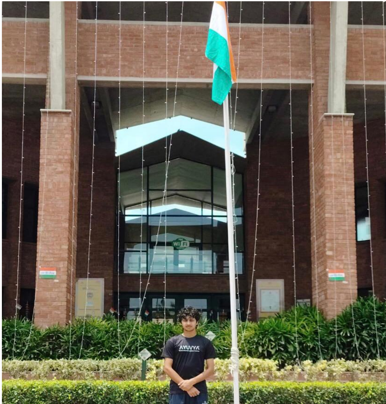
Image 1: "A proud student witnessed the grand flag hoisting at PSIT College, celebrating the spirit of patriotism."