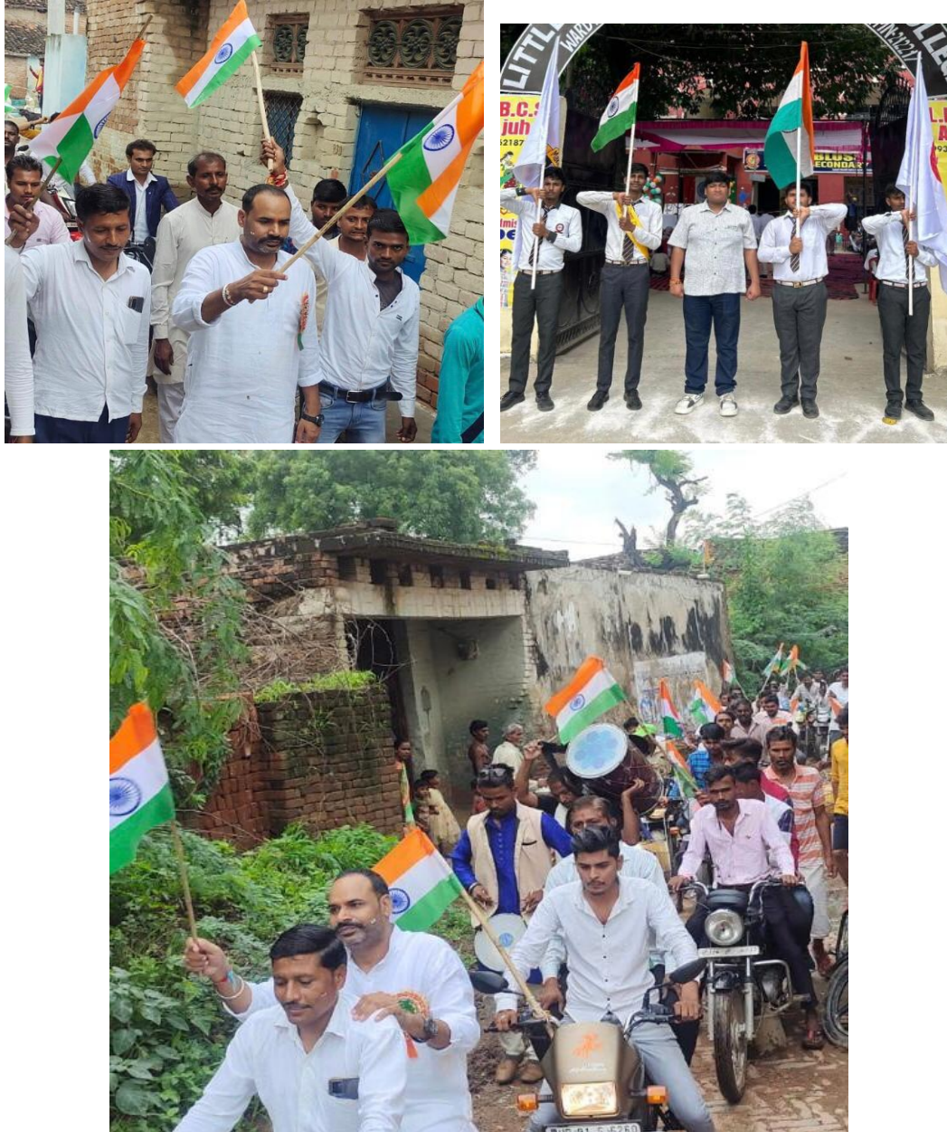
Image 2: "A large gathering of citizens enthusiastically participated in the Tiranga Yatra, showcasing unity and national pride."